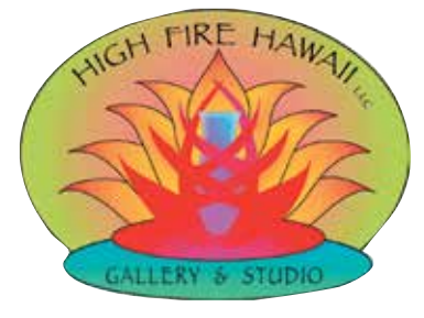
High Fire Hawaii, an art and ceramics gallery in Hilo, will host its 6th annual ART HELPS event on Small Business Saturday, November 26. Proceeds from any purchase made at the gallery during Art Helps will go toward helping our shelter animals.

Purchase FEAST ON THE BEACH holiday gala tickets from HIHS. org and 50% of the proceeds benefit shelter animals. Don't delay and miss out on this perennial sell out.