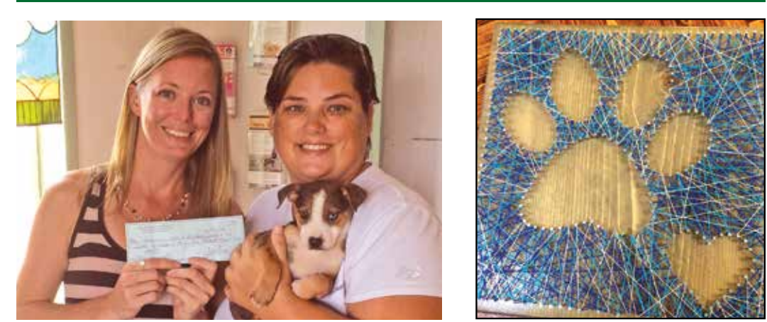
Mahalo to Tess's Table Arts and Crafts Workshop and all those who came out to show their support at the String Art Fundraiser. Over $700 was raised for our shelter animals along with some amazing string art projects.